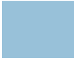
Secondary Pale Blue # 98C1D9 RGB: 152 / 193 / 217 CMYK: 45 / 13 / 11 / 0 Pantone 644 C