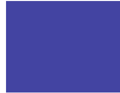
Secondary Purple # 4344A2 RGB: 67 / 68 / 162 CMYK: 86 / 78 / 0 / 0 Pantone 2117 C