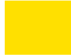
Secondary Yellow # FFE000 RGB: 255 / 224 / 0 CMYK: 2 / 8 / 91 / 0 Pantone Yellow C