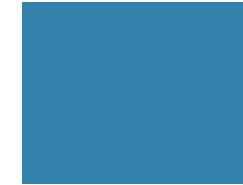
Secondary Blue # 3483AC RGB: 52 / 131 / 172 CMYK: 78 / 37 / 19 / 4 Pantone 2454 C